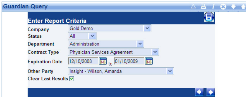
Figure 2 – Search Criteria